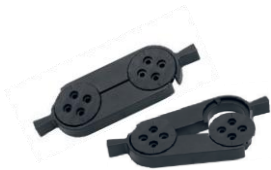
檯面拼接器 Countertop Splicer (plastic)