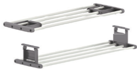
折疊書網架 Folding bookshelf