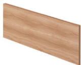
可裝木檔板 wood modesty pane